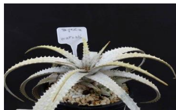
Forzzaea warasii

I am sure many would have looked lovingly at the Dyckia warasii especially as it had started offsetting. It is a challenge to grow through Adelaide winters as it should because it was originally described as a Cryptanthus and we know that traditionally you do not water on the top in winter. Yes it is an odd looking Cryptanthus , so much so it is now Forzzaea . Homework reading follows where you can see where I spend my spare time.