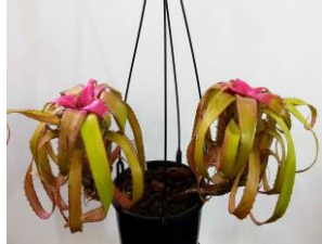
Neoregelia rosea 'Pink Spider' Query