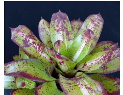
Neoregelia 'Casoba'

These days there are so many hybrids around with similar spelt names and it pays to check the BCR. Just one recent example was the Neoregelia 'Casaba' on display which you won't find in the BCR. You will find a 'Casoba' where it shows that 'Casaba' is a wrong spelling. It had its origins in Brazil some 13 years ago but was only recently registered AND this was done by the Registrar. It is a good job we have such a keen Registrar. It is an interesting job where you are an unpaid employee of the Bromeliad Society International. What you may not realise is that the BSI is formally the ICRA (International Cultivar Registration Authority) for Bromeliaceae. All members, be it Board, Judges, Affiliates etc. should acknowledge this and not just leave it up to the registrar.