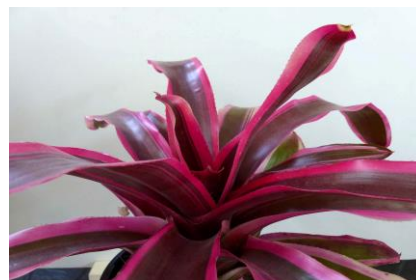
Neoregelia 'Bob's Dream'