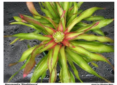
Neoregelia 'Shelldance'

Note added 2/2012. Questions asked at a Brom Soc of South Australia meeting about the odd looking inflorescence suggests this may be a x Neotanthus hybrid.